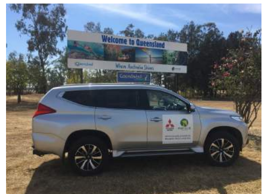
The Pony Club Pajero went to Toowoomba for the 2017 Nationals

For full offer terms and conditions, please contact your local Mitsubishi Motors dealer.